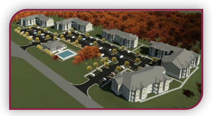
SketchUp model from senior design team mentored by Bohler, presented at Summer 2020 General Meeting

LDDI's 2020 summer meeting was held on Friday, June 19<sup>th</sup>, 2020 and featured an impressive panel of speakers representing both municipal governments and private consulting firms to discuss "The Impact of the COVID-19 Pandemic on the Land Development Industry." The panelists highlighted how their organizations had to adapt quickly to a mostly or completely remote work environment and discussed how they were able to continue to be effective in their respective roles and responsibilities. Additionally, they offered some thoughts regarding adaptions that are translatable to the post-COVID workplace.