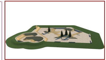
Revitalization of the Catocin Skate Park for the Town of Leesburg, Virginia (3D rendering designed by Spohn Ranch).

This collaboration presented a unique opportunity for creativity in helping the community and advancing the revitalization of the Catocin Skate Park for the Town of Leesburg.