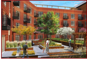
A vacant portion of the Specialty Hospital of Washington is transforming into a luxury apartment residence.