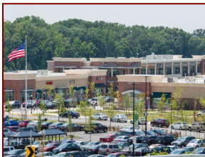
The Hilltop Village Center is a redeveloped landfill site in Fairfax County that integrates 350,000 SF of retail, restaurants, and office space.

The success of this project is due in part to the coordination with DOEE and the Historic Preservation Review Board (HPRB), and continuous outreach to the community and Advisory Neighborhood Commission (ANC) of Capitol Hill.