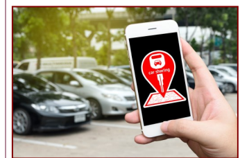
Car-sharing can provide "part-time" personal transportation, where one vehicle can address the mobility needs of several individuals, lowering the current overwhelming dependency on the automobile.