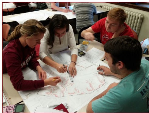
A student team works on their design during the third annual LDDI Design Charrette Competition.