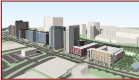
Bowman Consulting has provided numerous services to the Tysons Corner development.