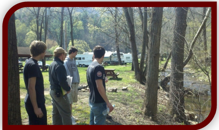
SLDC members meet with Camp Alta Mons officials to discuss service project opportunities