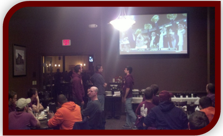
Students and practitioners enjoy Virginia Tech's victory over the Georgia Tech Yellow Jackets

When fall rolls around, few things in the Hokie community take priority over football. Looking to capitalize on the passionate Virginia Tech fan base to further its mission to bring students together with industry professionals, last fall LDDI hosted a football viewing party for the Hokies' Thursday night showdown against Georgia Tech. The event was held at Bull & Bones restaurant in Blacksburg and was very well attended by CEE students and land development professionals, some of whom made the trip to Blacksburg all the way from Hampton Roads and northern Virginia!